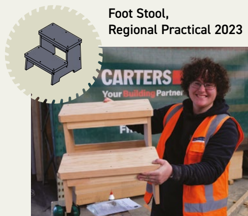
Foot Stool, Regional Practical 2023