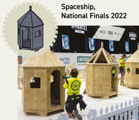
Spaceship, National Finals 2022