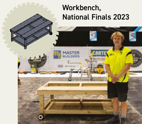
Workbench, National Finals 2023