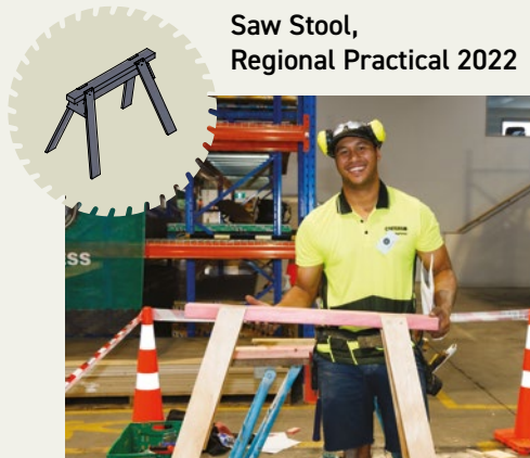
Saw Stool, Regional Practical 2022

We can't tell you that, you'll find out on the day. What we can show you is what our apprentices from previous years have made in the regional and national practicals.