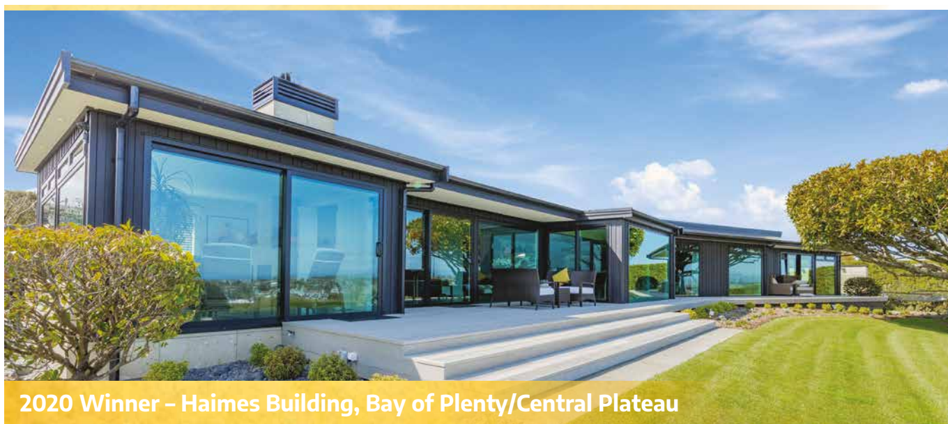
2020 Winner – Haimes Building, Bay of Plenty/Central Plateau