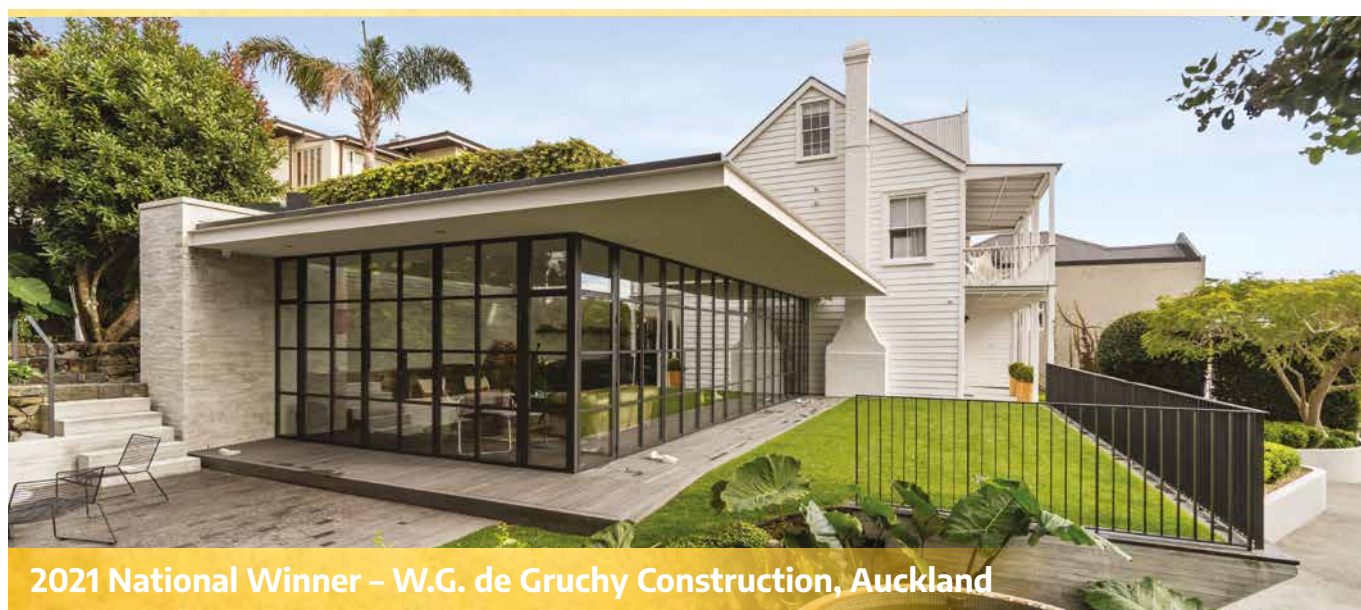
2021 National Winner – W.G. de Gruchy Construction, Auckland